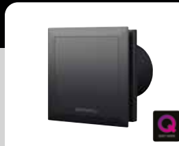
QuietAir QT100 Black Edition B