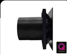
QuietAir QT100 Black Edition HT