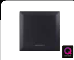
QuietAir QT100 Black Edition T