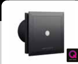
QuietAir QT100 Black Edition MST